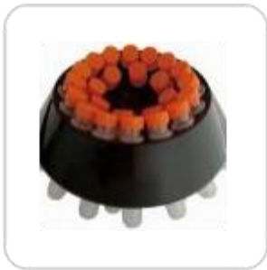
24× 10ml(4000r/min) RFC:2200×g